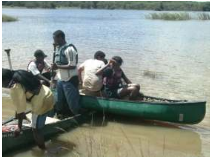
Sixth Form Students competing in 'Chariots of Fire'

The final leg of the challenge on day two was for some the most enjoyable, but for most it was heartbreaking. A Chariot had to be constructed using parts collected from the Dam, and then there was a race to the finishing line with fire burning in the chariot. But at the end of it all, we all emerged winners!