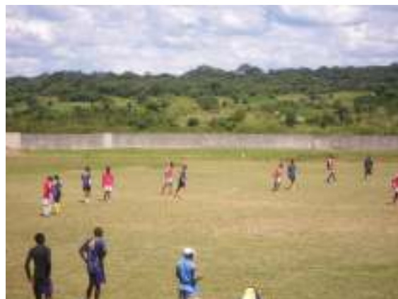
Chengelo playing soccer at Mpelembe